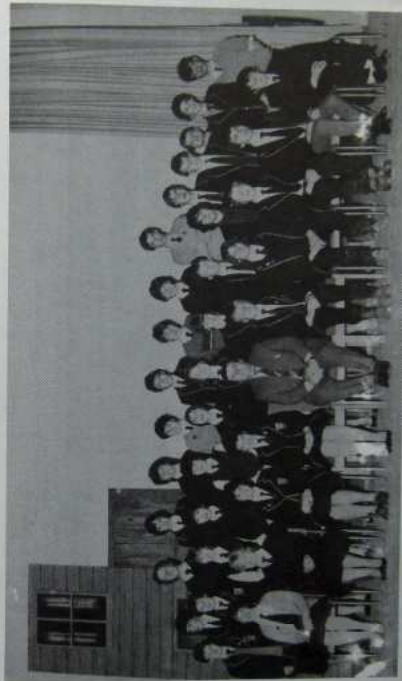
K.G.S. PREFECTS 1982-83